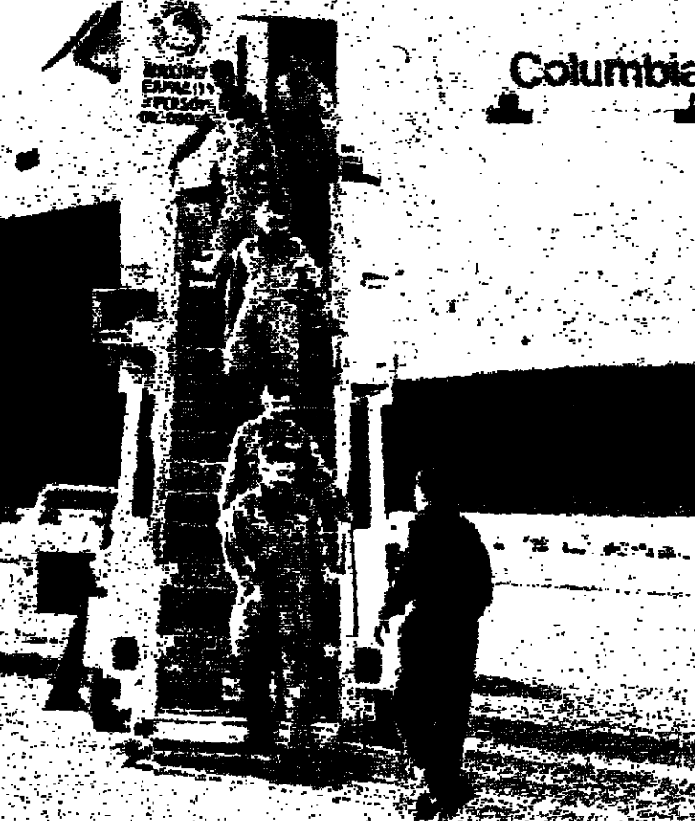
The Columbia space shuttle returns yesterday from a 10-day orbital flight with the largest crew ever to fly in space. A NASA official greets (from bottom upwards) Flight Commander John Young, Maj. Brewster Shaw (payload specialist), Dr. Robert Parker (mission-control specialist), Ulf Merbold (payload specialist), Dr. Owen Garriot (mission specialist), and Byron Lichtenberg (payload specialist).

N-BLAST. — France exploded a 15-kiloton nuclear test device at its Mururoa atoll testing ground in the Pacific for the second time in less than a week, New Zealand officials said in Wellington Friday.